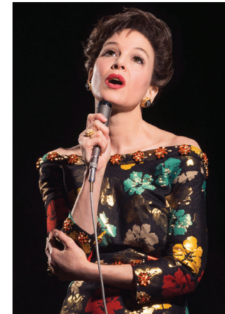
LEFT TO RIGHT: Renée Zellweger as Judy Garland; director Martin Scorsese.