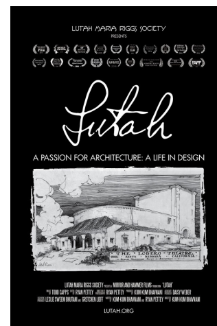
LEFT TO RIGHT: Lutah ; one of Riggs's architectural drawings.