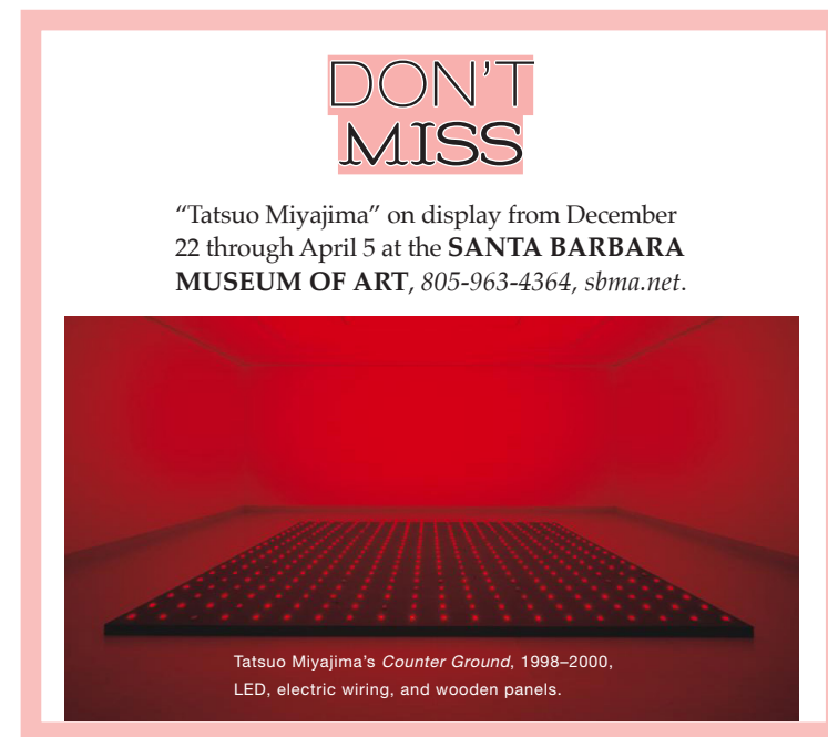
"Tatsuo Miyajima" on display from December 22 through April 5 at the SANTA BARBARA MUSEUM OF ART , 805-963-4364, sbma.net .