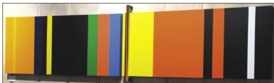
Black, Among Other Colors (L) and Raising the Bar (R) by Jo Merit is on view at Gallery 113.

Color: Bold + Simple , an exhibition featuring some of her newest works that explore the interaction of color and texture, is on view through January 29th.