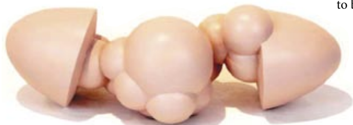
Tickled Pink , 2012 by Ed Inks . 10" x 20" x 20", Cast aluminum

Ed Inks Has Left the Building features 15 sculptures ranging in size from three inches to about seven feet high made from brass, lead, aluminum, and steel. Photographs of his larger public art pieces such as Musical Chairs installed at Westmont College and Not Yet Full at SBCC will be incorporated into the exhibit. The work spans from 2007 to the present with a couple recent,